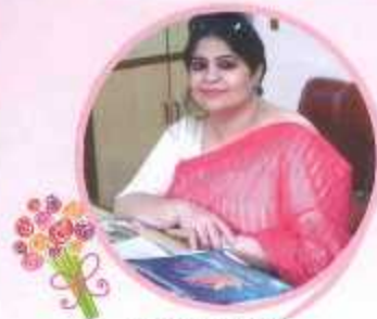
Head of School

"Education is not just about coming to school and getting a degree. It's about widening your knowledge and absorbing the truth about life, learning values like gratitude, respecting others and showing humility." With these principles, we move forward and believe that each one of us has a purpose in life and is unique in his or her own way. When we blend this unique talent with service to others, we experience the ecstasy and exultation of own spirit which is the ultimate goal of our school.